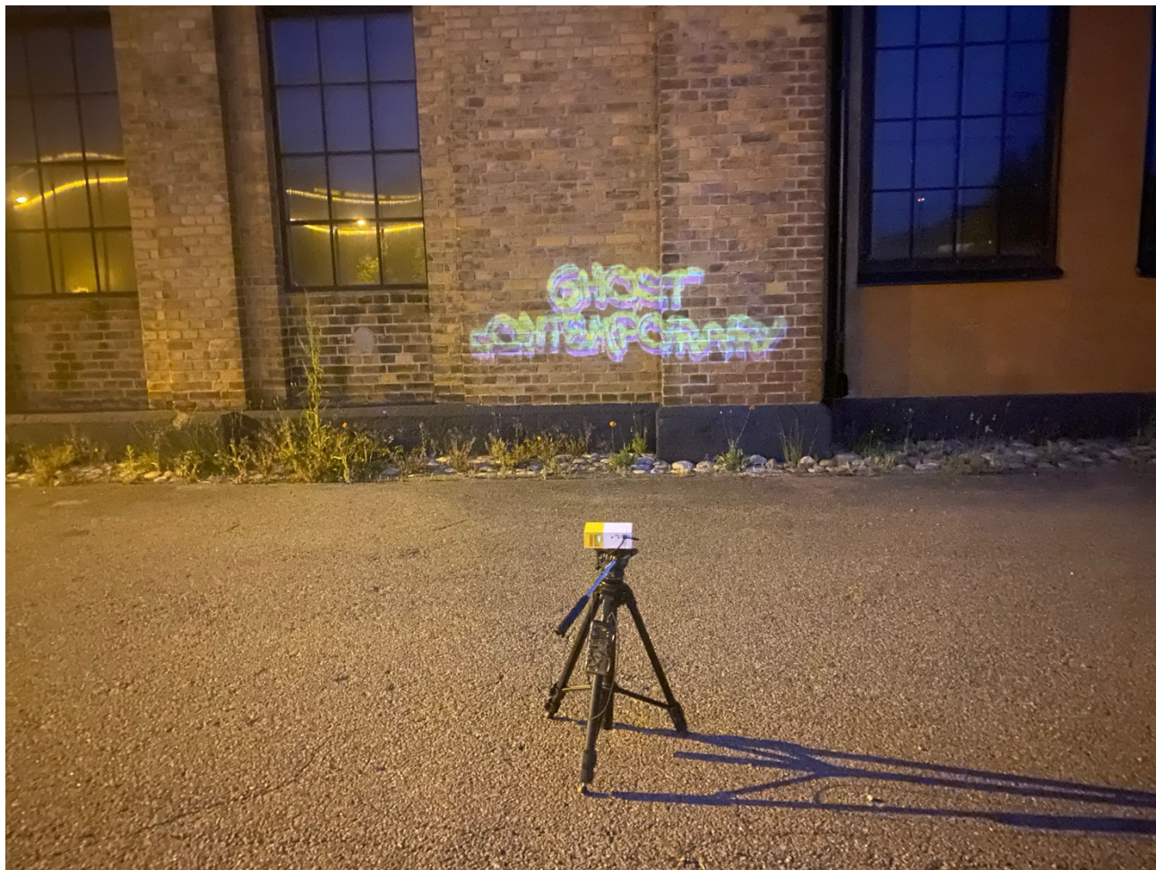
Ghost Contemporary tillfällig målning batteridreven projektor jpg av tag. 2024