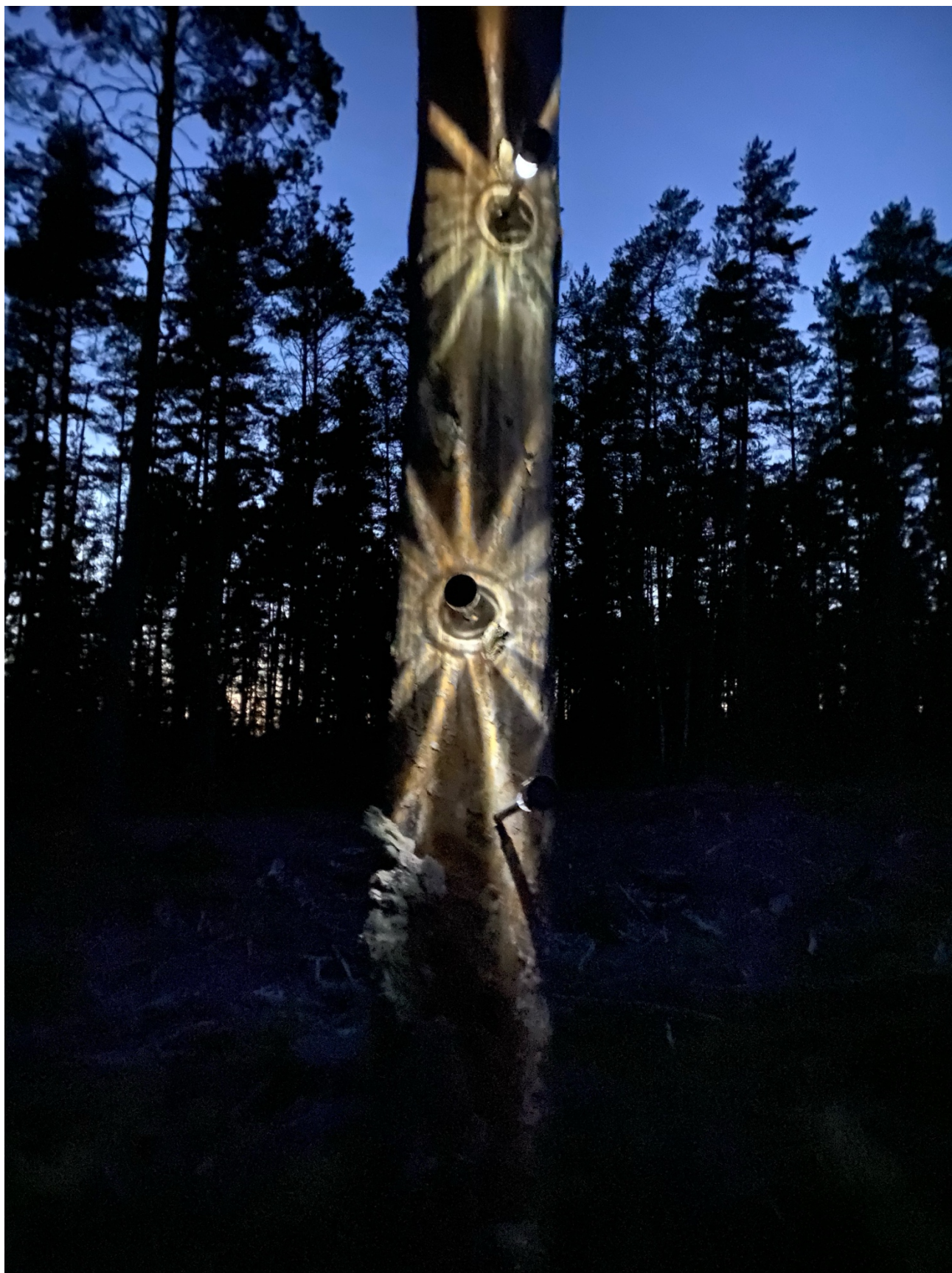
Autonomous sculpture, solar panels, sensors, diodes, batteries