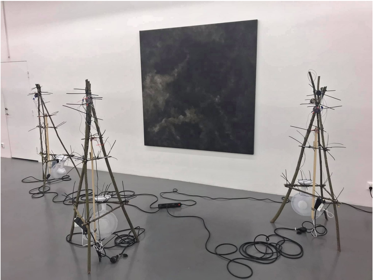
Bee relay project (white cube version) Passagen Konsthall, 2021, Linköping, electric fans, wood, microcomputer, speakers, sequencers, painting 195x195 cm, oil on canvas.