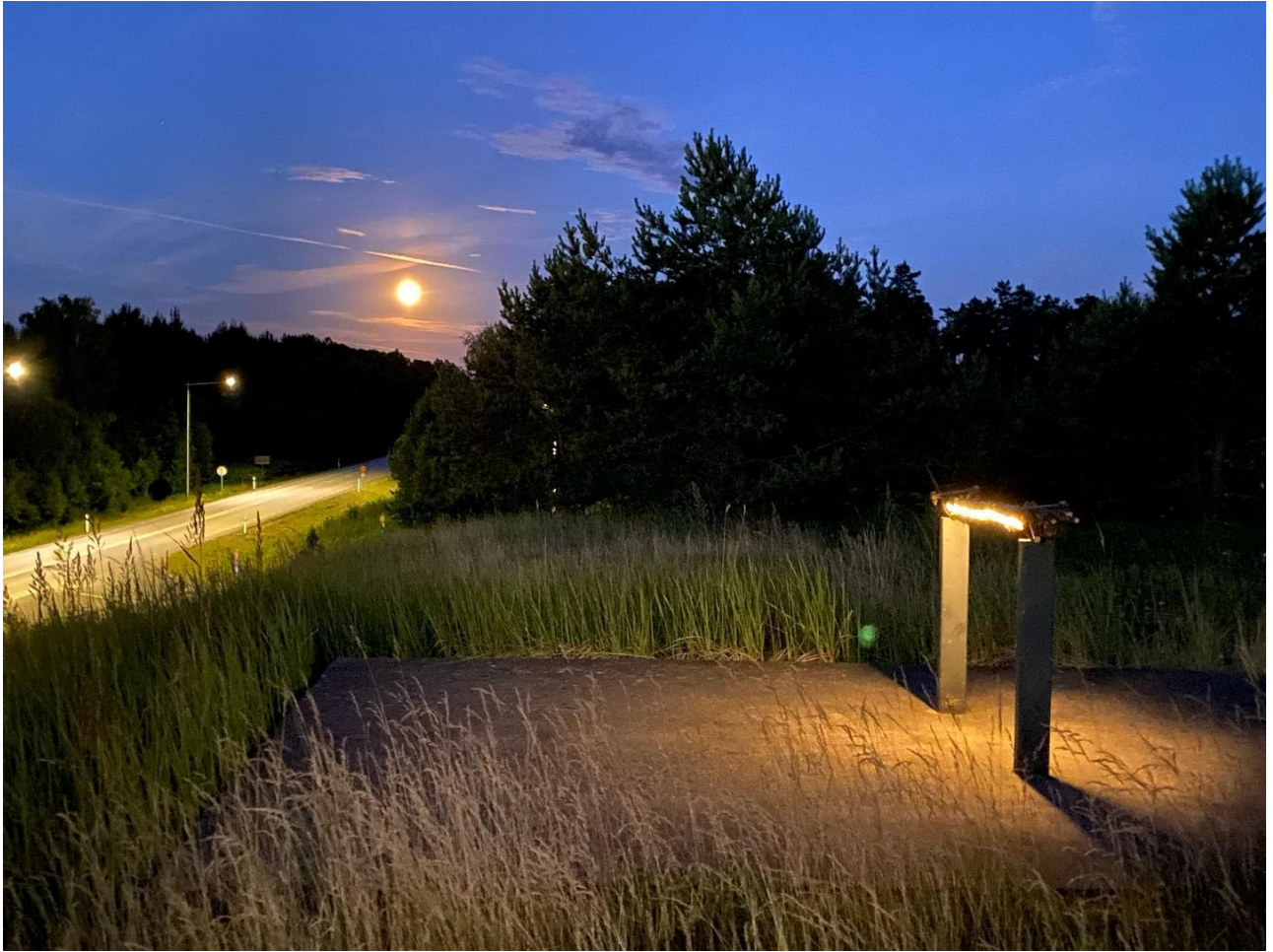
A message to all Citizens, Magnus Wassborg 2022, remodeled abandoned municipal information place outside a small town (Eksjö) in Sweden.