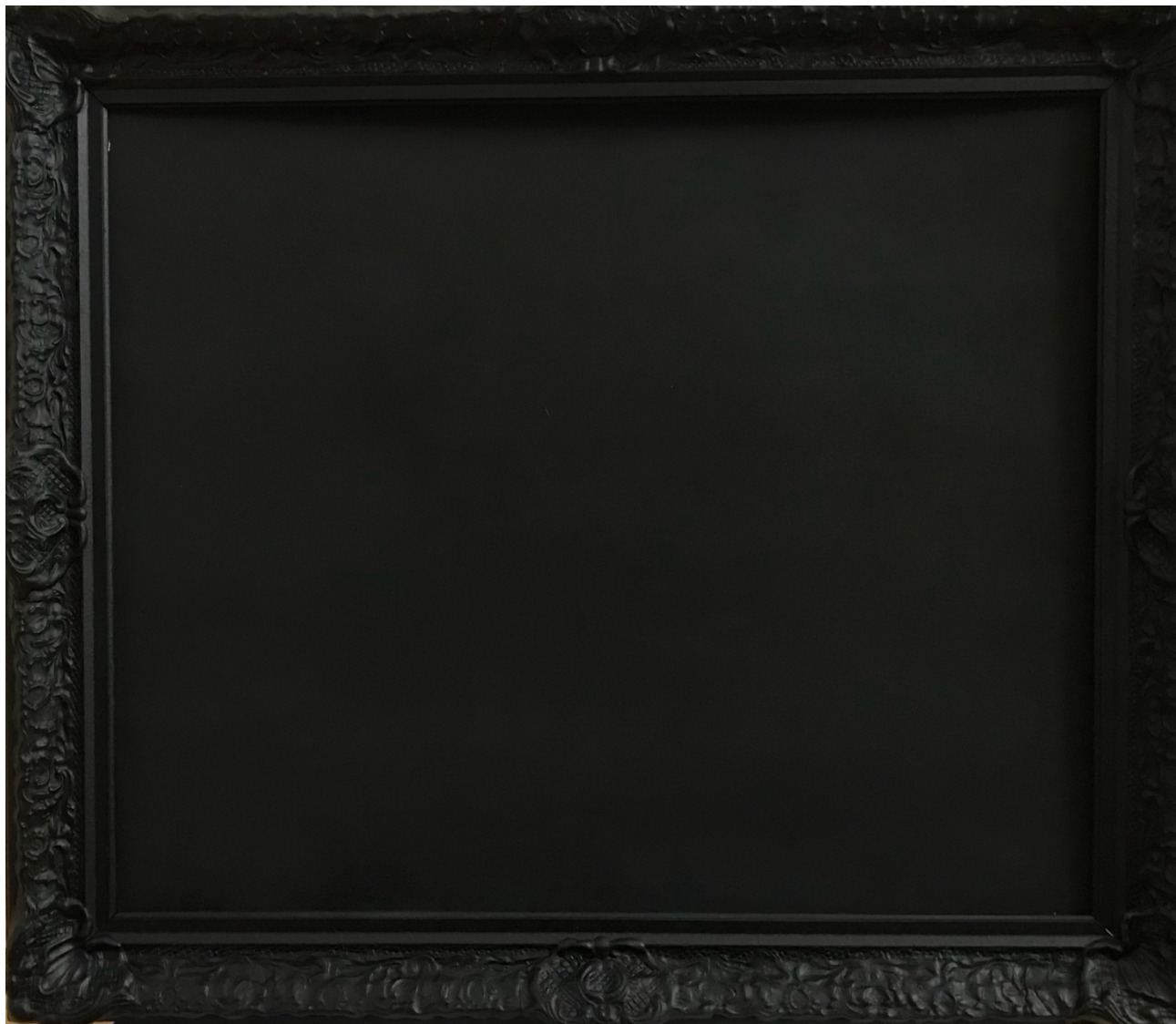
Painting watercolor on paper sketch for autonomous sculpture, 50x70 cm 2022