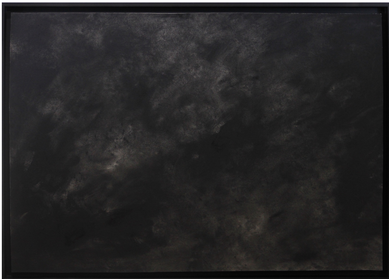
Painting watercolor on paper sketch for autonomous sculpture 70x100 cm 2022