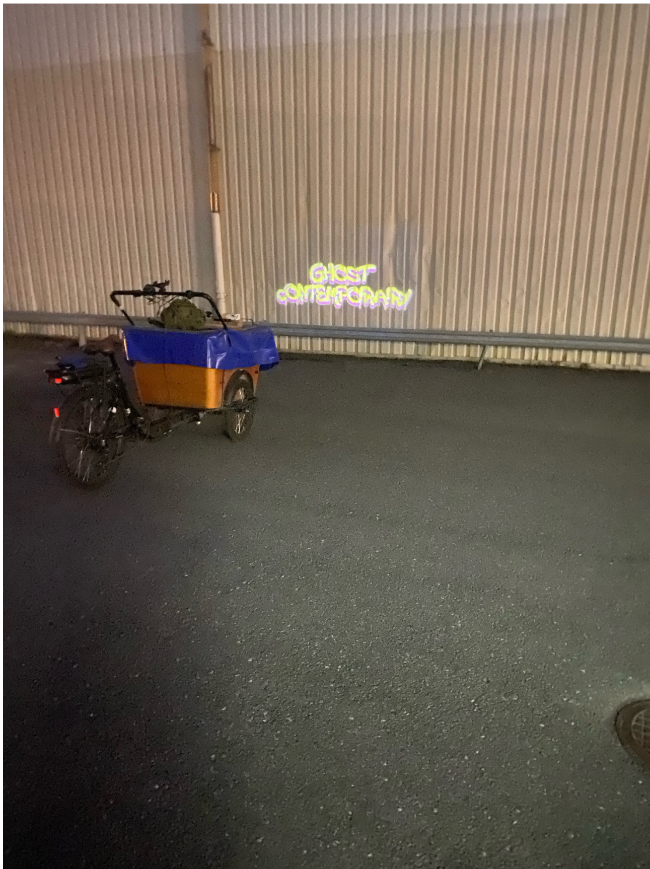
Ghost Contemporary, temporary painting battery operated projector jpg of tag. 2024