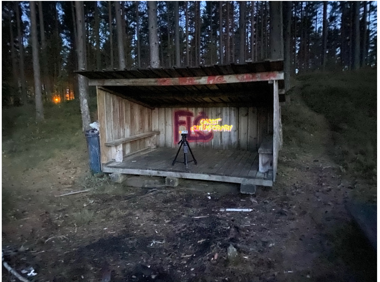
Ghost Contemporary, temporary painting battery operated projector jpg of tag. 2024