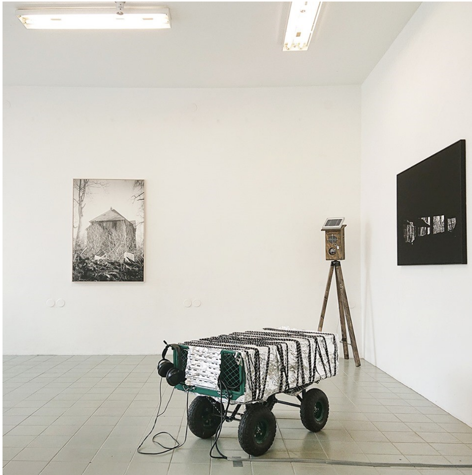
Molekyl Gallery Malmö Sweden 2019 Magnus Wassborg, Annika Thörn Legzdins (photos) faraday cage, repeated message (how to start a militia) aluminum, steel

Humanity's belief that through expansion, one saves one's own habitat, through development (regardless of what is being developed), so humanity goes one step closer to its own perfection.