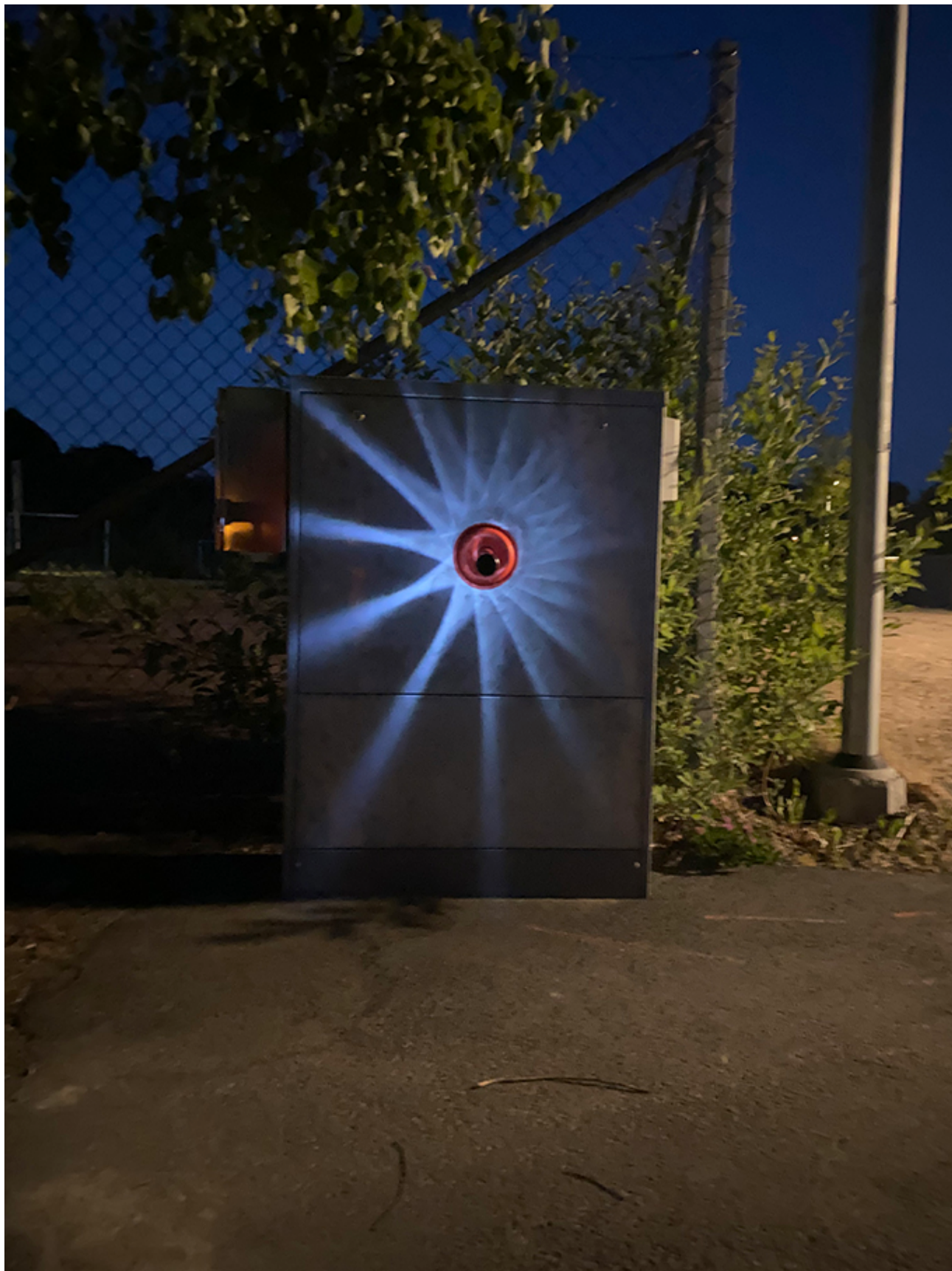
Autonomous sculpture, solar panels, batteries, diods, sensors, 2024