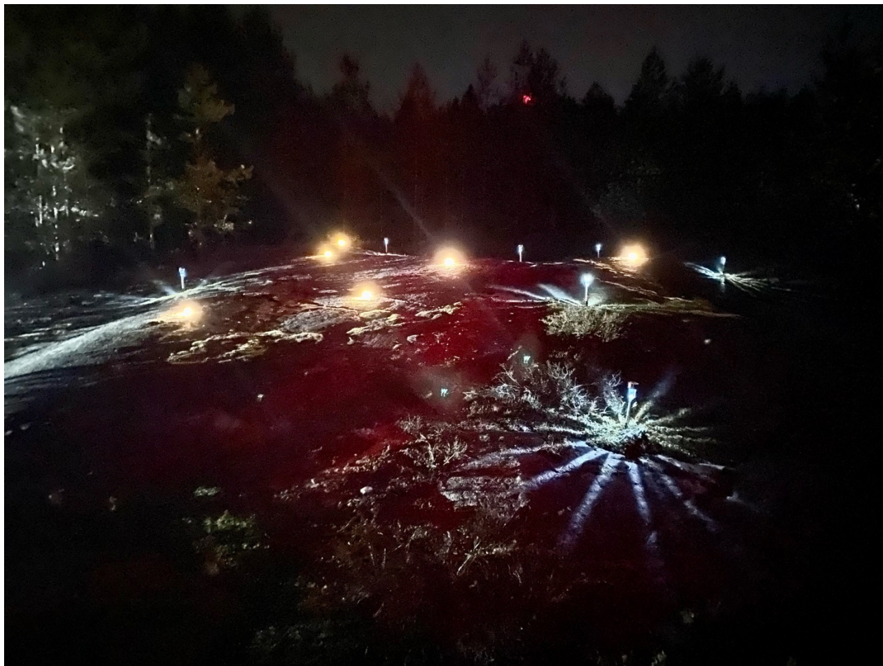
Autonom skulpture/landscape painting solarpanels diods, sensors batteries