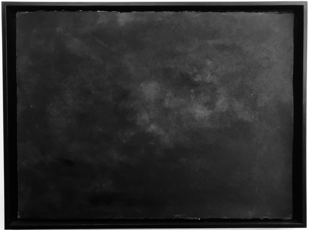
Painting watercolor on paper sketch för autonomous sculpture 50x70 cm 2022