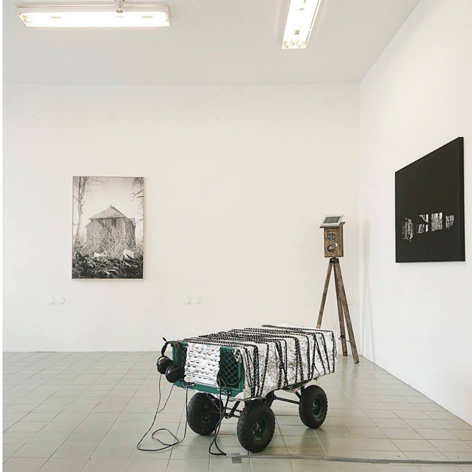
Molekyl Gallery Malmö Sweden 2019 Magnus Wassborg, Annika Thörn Legzdins (photos) faraday cage, repeated message (how to start a militia) aluminum, steel

voice synthesis telling how to start a militia. Magnus Wassborg 2019