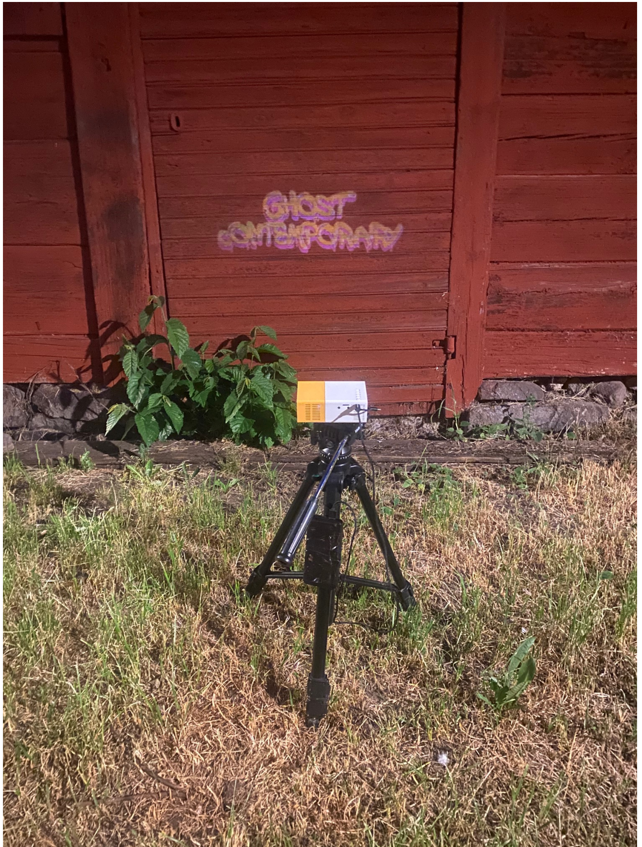
Ghost Contemporary, temporary painting battery operated projector jpg of tag. 2024