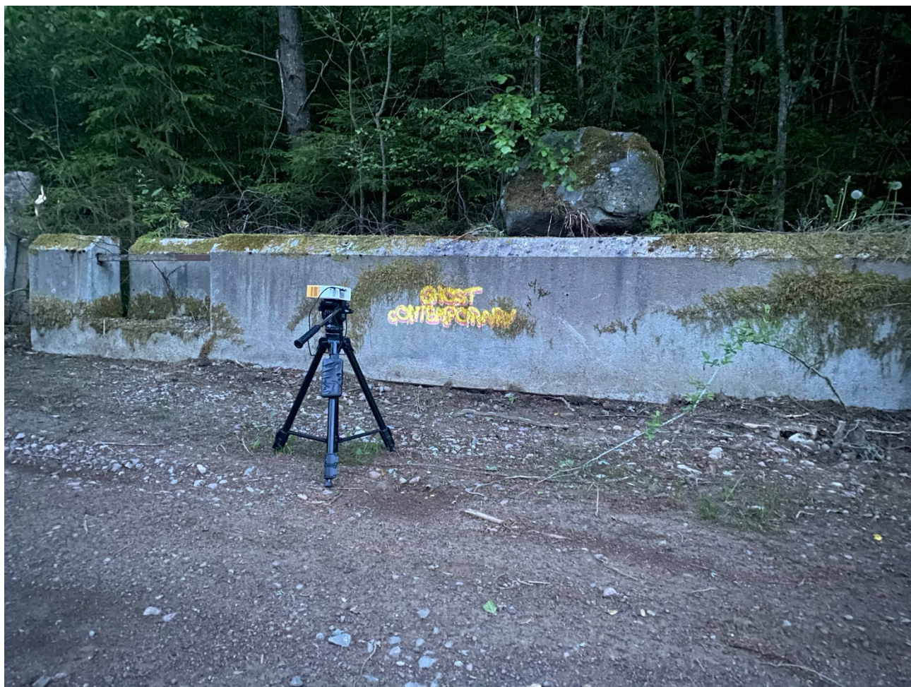
Ghost Contemporary, temporary painting battery operated projector jpg of tag. 2024